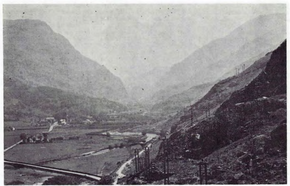
The line being dismantled can be seen descending into the valley, while the new lines replacing it march over the hillside on the right.